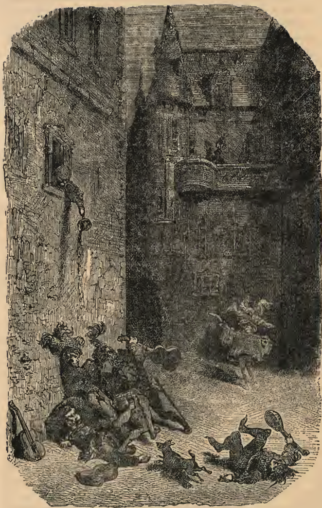
A free fight only brought a smile to her lips.